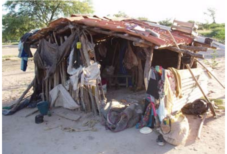
House before the new roof systems were built

Background: A recent LDS Humanitarian Services project provided building materials and tools so that 53 families living in Abundancia could erect a large roofed shelter on their lot. These structures include a rainwater collection and storage system, for the first time providing families with a source of water. However, each family still lives in a cramped, dirt-floor hovel built in 1990 as a temporary shelter. Some are attempting to transfer the plastic sheeting, sticks and mud, and galvanized panels used in the original home to the new shelters – essentially continuing the inadequate and disease-ridden housing they have endured for 17 years.